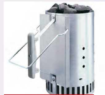
Weber Rapidfire Chimney Starter

Try one of these durable “aluminized-steel” gadgets to start your charcoal and you’ll never go back to starter-fluid. For one, they use newspaper (cheap and non-polluting). Place canister with coals on top of crumpled newspapers and light. Other, cheaper versions can be found, but this one is superior (item 7416: $24.99 at Johnstone’s (below); or about half that from Fred Meyer in the U.S.)